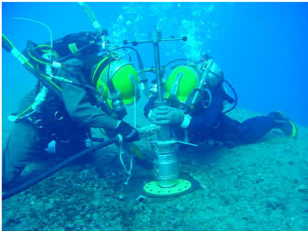
Divers 'hot-tapping' the USS Mississinewa; a technique used to extract fuel from sunken vessels

Pollution may also pose a direct threat to human health . Munitions can explode, and research suggests that eating fish exposed to chemicals found in some wrecks may be toxic and carcinogenic.