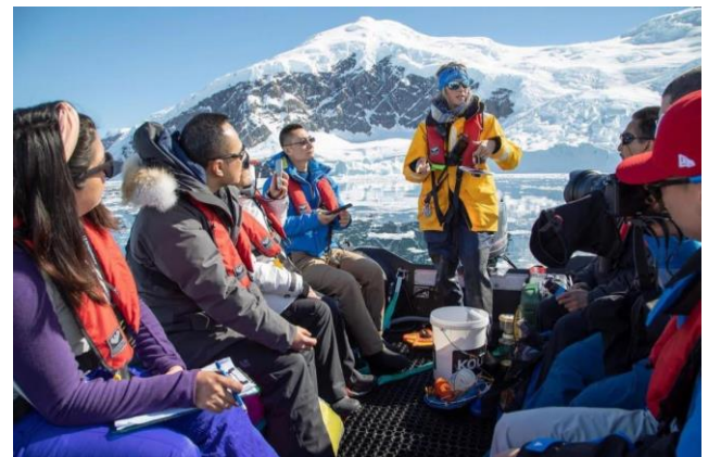
Tourists participating in the FjordPhyto citizen science project. Tourist vessels also help scientists access their research sites.

Researchers should also evaluate how visiting Antarctica changes tourists’ long-term behaviour.